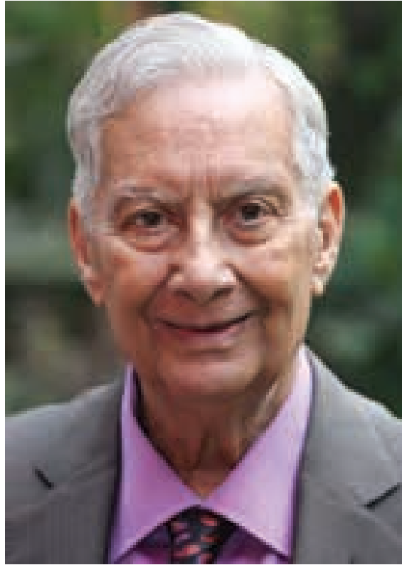
Mr. B.K. Birla - Chairman